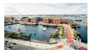
Albert Dock, Liverpool