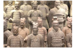
The Terracotta Warriors

亮点: 庆祝利物浦的文化和传统, 因为这个热闹的城市标志着“欧洲文化之都”成立十周年。2018 年的利物浦庆祝城市的创造力 - 来自世界各地的古代兵马俑展览, 让人难以窥见中国第一位皇帝秦新元的故事, 著名的艾伯特码头举办了一系列的旅游景点, 包括标志性的‘甲壳虫故事’和新的‘英国音乐体验’。为什么不前往历史悠久的市中心, 浏览博物馆; 画廊和大型商店, 从高街商店到一个宝石, 在这个充满活力的特别城市度过。