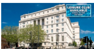
Adelphi Hotel & Spa, Liverpool