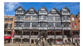
Chester town centre

* Payment must be paid before 28 th March, 2018. No matter what happens cannot be refund